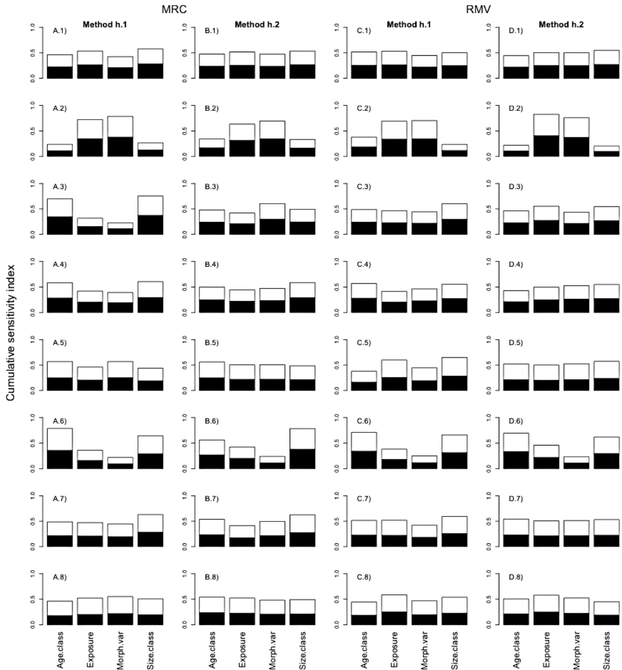
Figura 2. Mediciones de la sensibilidad del modelo de observación en la variabilidad en los parámetros de la población. Barras representan el efecto acumulativo de cada variable (índices de 1 er orden - negro) y de la interacción entre factores (orden total - blanco) en las predicciones de cada modelo. Paneles organizados en columnas de acuerdo a la metodología de muestreo (MRC y RMV), y el estimador (Método h.1 y h.2 método, véase el texto para más detalles); filas representan el tamaño de la población (véase el texto para más detalles). Índices ilustrados (i.e., 1er y total) son los resultados de un análisis de descomposición de la varianza utilizando el método FAST. Tamaños poblaciones (filas) de arriba a abajo son 1, 2, 3, 4, 5, 6, 7 y 8. Columnas de izquierda a derecha son: MRC h.1 , MRC h.2 , RMV h.1 y RMV h.2 .