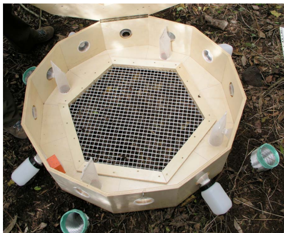
Figura 2: Fotografía del interior de la trampa. Figure 2: Photo of trap, interior.

attracted to cadavers (Arnaldos et al. 2001, 2004, Prado e Castro 2005, Battán Horenstein et al. 2007). Recently, Ordóñez et al. (2008) proved the efficiency of Schoenly trap in the collection of adult sarcosaprophagous dipterans, where it is described as a superior methodology to perform inventories of Diptera associated with carcasses and recommended for the study of sarcosaprophagous succession.