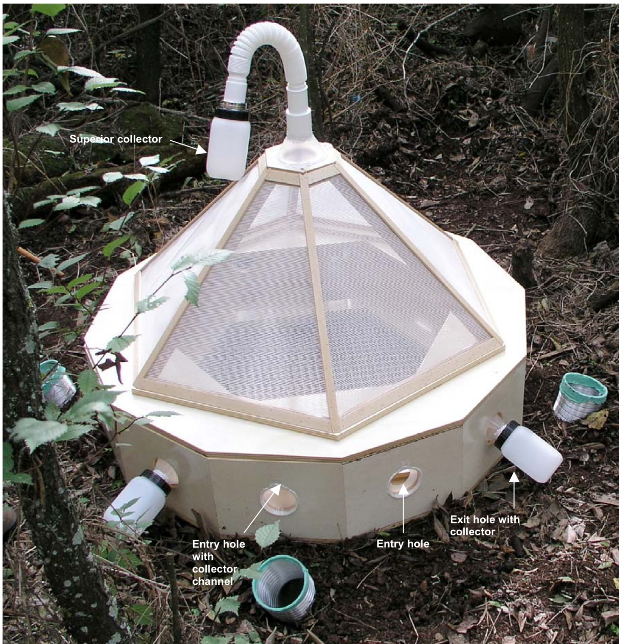
Figura 1: Fotografía del exterior de la trampa.

emerging inside the trap are also collected, as well as migratory larvae that leave the carcass. With this method, all insects that are attracted to the carcass and enter the trap are captured, thus giving a total census, not only samples. Physical contact with the bait during sampling is not needed, arthropods are collected continuously and automatically, reducing the disturbance in the colonization and collector's bias is not introduced. Even though, only a few works refer Schoenly traps as methodology for collecting arthropods