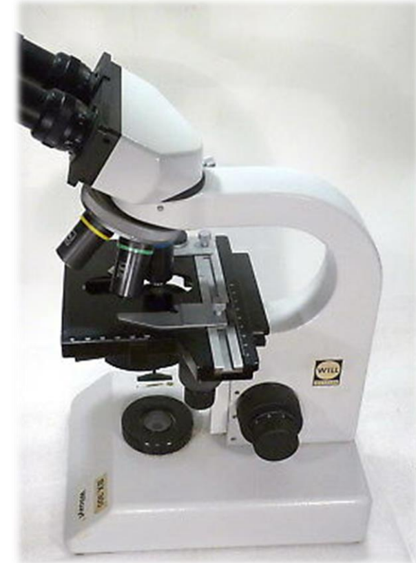
WILL Wetzlar: mod. BX300