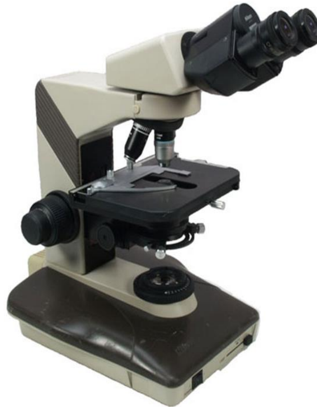
NIKON: mod. Labophot-2