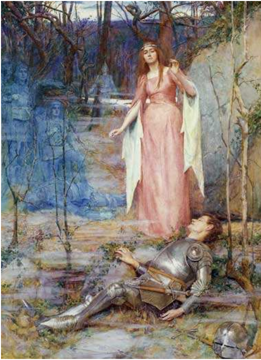
PLATE 3. JOHN WILLIAM WATERHOUSE (1849-1917).