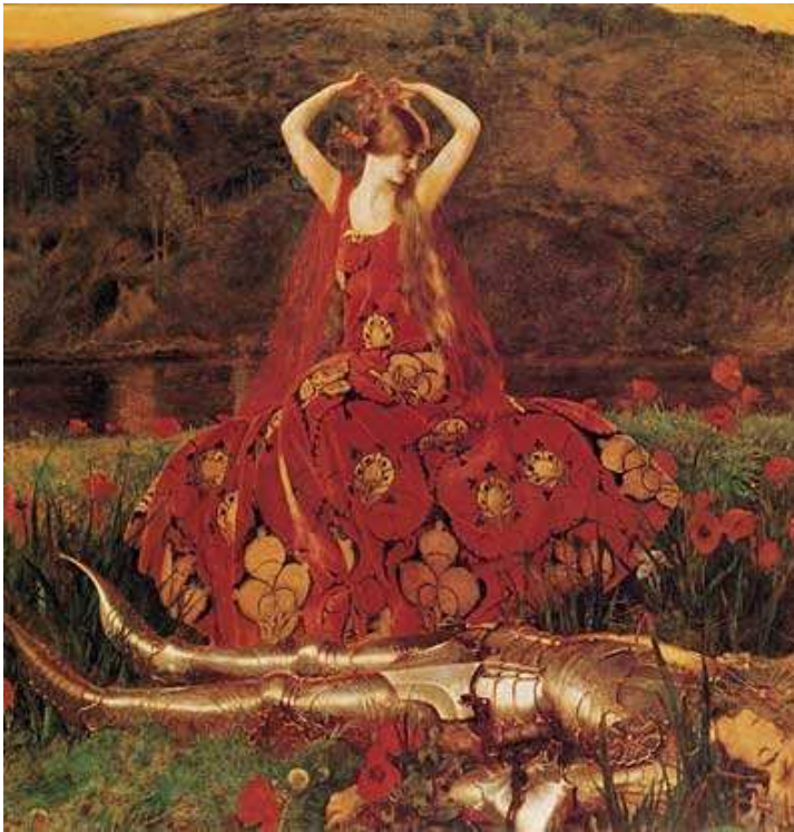
PLATE 5. SIR FRANK DICKSEE (1853-1928)